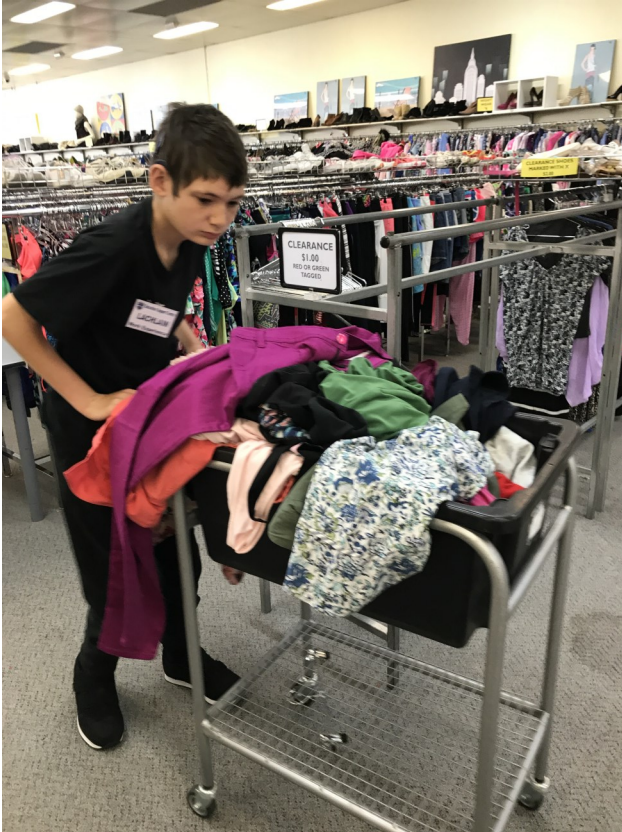
LACHLAIN – GOOD SAMMY'S "I liked cleaning the books and bringing in the bins full of the clothes and putting the yellow bins away".