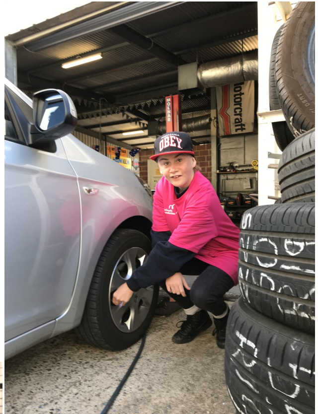
SHELBY – PEEL TYRE SERVICE "I really enjoyed being in the workshop and changing tyres. The staff were good".