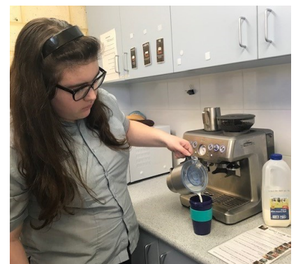
Making coffee during Business Enterprises