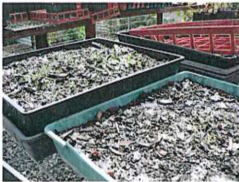
The green tinge is actually a few hundred plants germinated from our own seed.

To date students have been tidying up around the nursery including weeding and re-potting. During the hot windy summer our seedlings died so students have already reseeded in preparation for weeks of work. Fortunately our new group are enthusiastic and have great work ethics. We are certainly looking forward to meeting other conservationists and introducing ourselves to the City of Mandurah.