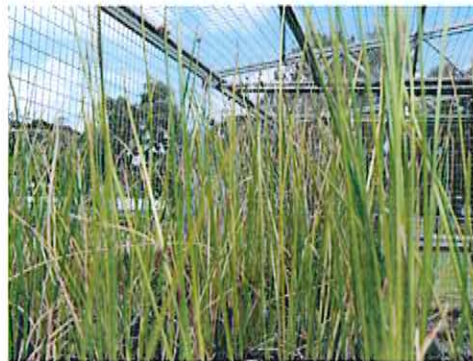
Eventually they will look like this.

Although the season has been irregular our garden had a few surprises after the holiday break. Students have been sharing rock melon and waiting eagerly for the watermelons to ripen.