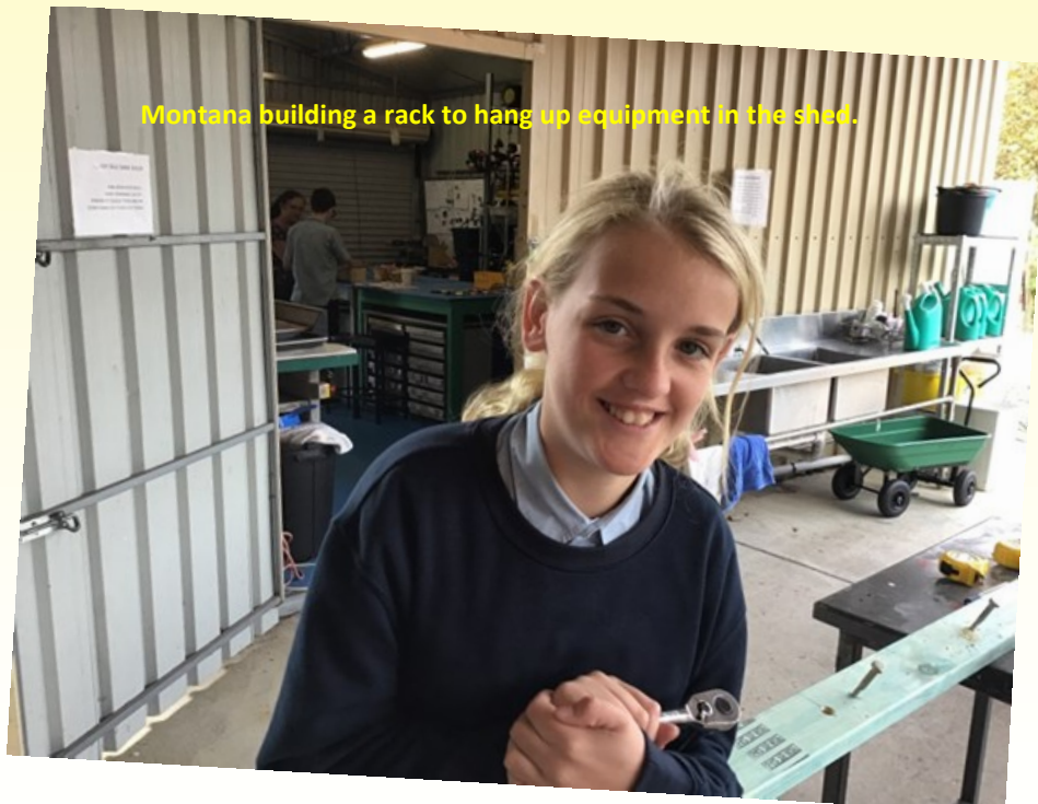
Montana building a rack to hang up equipment in the shed.