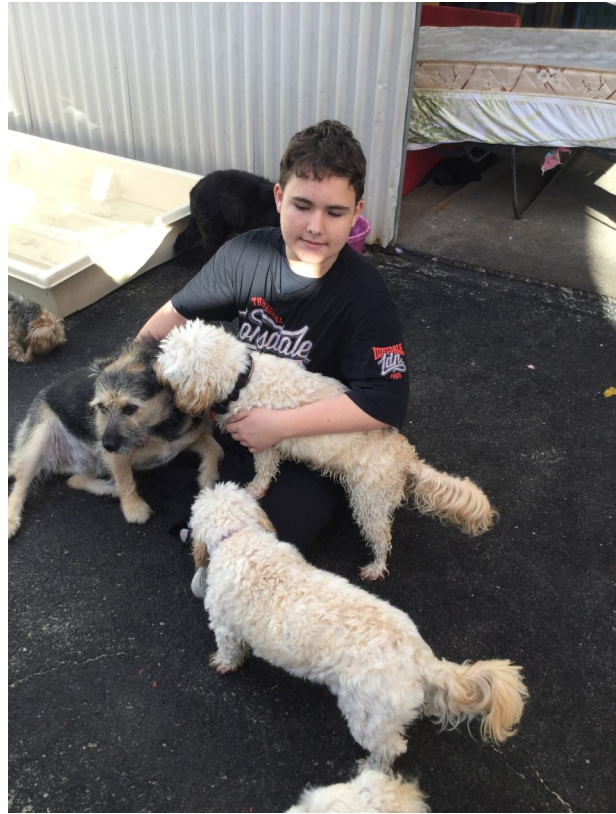
JACK – PEEKABOO DOG WASH & GROOMING

“I really enjoyed leading the horses and helping the kids ride the horses”