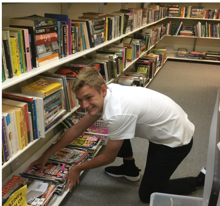
PRESTON – GOOD SAMMY’S “I loved stacking the toys at Good Sammy’s!”