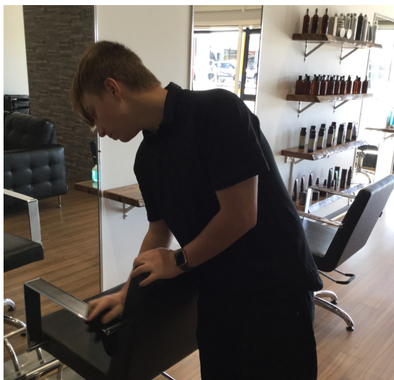
FORREST – CLAIRE HAIR BOUTIQUE “I liked that I got to work in a nice place. The staff showed me lots of new skills”